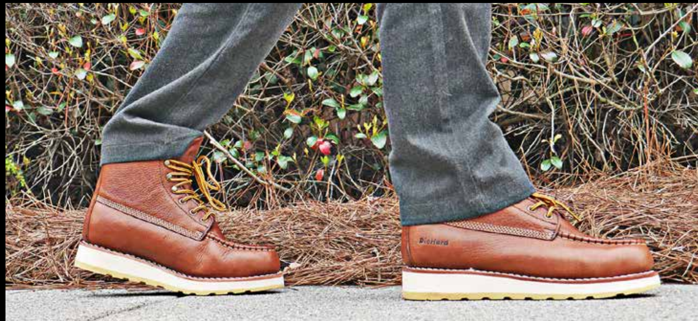
PHOTOGRAPHY / CATALOG DESIGN BY RAY GAUTHIER

DieHard is growing to deliver products that reach new frontiers while still delivering the ultimate performance and dependable power customers have relied on since 1967.