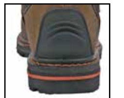
Heel Kick Off